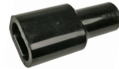
Black Vinyl 3-Way Receptacle Use .157 Bullet