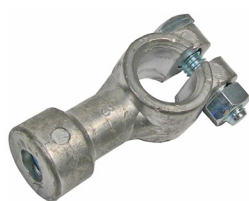
Converts Post Batteries To Side Mount (1 each pos & neg)