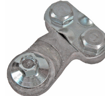
Emergency Side Mount Lead Terminal Fits All Cables Includes 3/8" Side Bolt