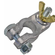
Universal Lead Marine Brass Wing Nut