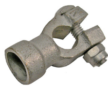
Straight Barrel Solid Brass - Plated Solder Type