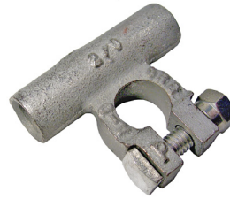
Flag Terminal Top Post Mount Solid Copper - Plated Crimp or Solder (not available carded)