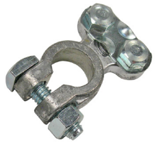
Universal Emergency Lead Terminal Fits Most Batteries #0880 Fits 6 - 1 Ga #0888 Fits 1 - 4/0 Ga