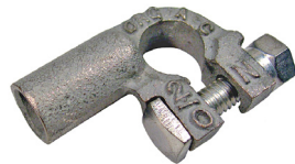
Right Angle Terminal Solid Copper - Plated Crimp or Solder (not available carded)