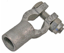
Straight Barrel Solid Copper - Plated Crimp or Solder