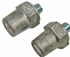
Adapts Side Mount Batteries For Conventional Cables Polarity Specific For Exact Fit (1 each pos & neg)