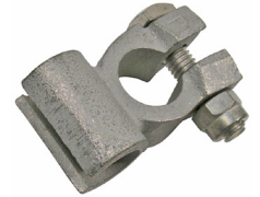
Split Barrel Solid Brass - Plated Solder Type