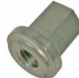
Hold Down Stud Nut 9/16" Hex Head Stainless Steel Group 31 Batteries Universal