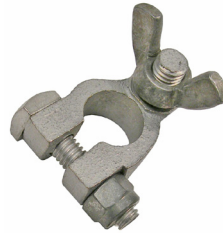
Universal Marine Wing Nut Solid Brass - Plated

Solder Pellets Shrink Tubing Page 20 & 27