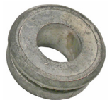
Allows More Cable Adjustment Use With #0869 For Dual Cable Hookup