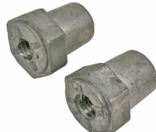
Adapts Deep Cycle/RV Batteries To Post Style Polarity Specific (1 each pos & neg)