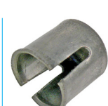
Slip Shims Over Worn Posts Universal