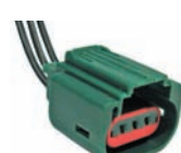
#5459PT (#5459C) Ford 2004 & F150 3-16 ga Leads Bulb 9008 & H13