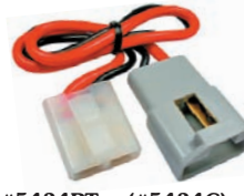
#5434PT (#5434C) Alternator Extender Harness Transistorized With Internal Regulator 1-12 ga & 1-16 ga Leads GM 1971+