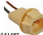
#5414PT (#5414C) Chrysler 1974-92 3588314, 4450821, 4400147 2-18 ga Leads Bulb 67, 158, 161, 168, 194, 194A