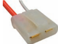
#5432PT (#5432C) Alternator Transistorized With Internal Regulator 1-12 ga & 1-16 ga Leads GM 624493 1971+