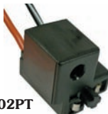
#5302PT (#5302C) Sealed Low Beam Mini Bulb 4703 2-16 ga Leads GM 86+