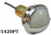
#5420PT (#5420C) Universal Utility Light 1-1/4" Truck Bumper Hole 1-20 ga Lead