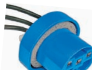
#5460PT (#5460C) GM-Ford-Chrysler GM 12117260 PT433 3-18 ga Leads Bulb 9007 & 9004