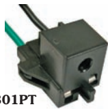
#5301PT (#5301C) Sealed Hi Beam Mini Bulb 4701 2-16 ga Leads GM 86+