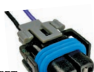
#5638PT (#5638C) GM 1983+ Ford 2005+ GM12043215 WP1781 2-18 ga Leads Bulb 862, 881, 886, 889, 894, 896, 898, H8, H11 & H16