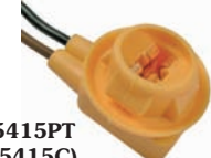
#5415PT (#5415C) Side Marker-Corner-Tail GM 12001470 1976-92 Ford EOSZ-15A442B 1988-89 2-18 ga Leads Bulb 67, 158, 161, 168, 194, 194A