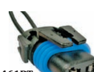
#5461PT (#5461C) High Beam GM 12101898 PT168 2-18 ga Leads Bulb 9005, 9145, H10, H4352