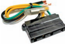
#5436PT (#5436C) Voltage Regulator Repair Harness 6-18 ga Leads Ford 1965-81