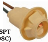
#5408PT (#5408C) Side Marker-License Fits most US Mfg Vehicles 2-18 ga Leads Bulb 67, 158, 161, 168, 194, 194A