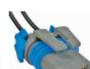
#5462PT (#5462C) Low Beam GM 12101897 PT167 2-18 ga Leads Bulb 9006 & H4351