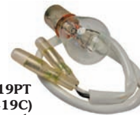
#5419PT (#5419C) Universal Tap Trailer Lights Into Existing Light System 2-22 ga Leads