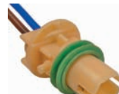
#5630PT (#5630C) GM 12083007 AC/Delco LS13 2-18 ga Leads Wedge Bulb #24