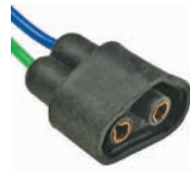
#5329PT (#5329C) Voltage Regulator Electronic 2-14 ga Leads Replaces #2983727 Chrysler 1972-87