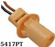
#5417PT (#5417C) License-Park-Tail GM 1973-95 8912750 & 12003896 2-16 ga Leads Bulb 161, 168, 194, 194A