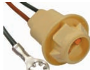
#5418PT (#5418C) GM 1968-95 6298892 & 6298886 2-16 ga Leads Bulb 194, 194A