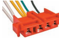
#5330PT (#5330C) Voltage Regulator 2-18 ga & 4-14 ga Leads Ford 1975-89