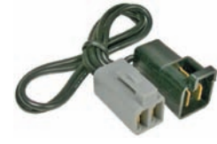
#5437PT (#5437C) Alternator Extender Harness With External Regulator 2-18 ga Leads GM Delcat 1962-78