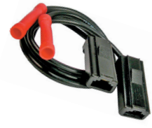
#5430PT (#5430C) Alternator Harness 2-18 ga Leads Chrysler 1965-88