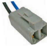
#5433PT (#5433C) Alternator With External Regulator 2-18 ga Leads GM Delcat 1962-76 GM 2977373