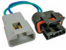
#5328PT (#5328C) Alternator Harness Adapts SI to CS Series With Alt Warn Light 2-16 ga Leads GM 12083462 1988-95