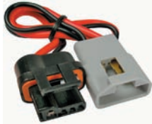
#5327PT (#5327C) Alternator Harness Adapts SI to CS Series Without Alt Warn Light 1-16 ga & 1-12 ga Leads GM 12102921 1988-95