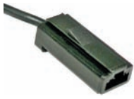
#5431PT (#5431C) Accessory Harness for Voltage Regulator / Temperature Sending Unit GM 1965-76 1-18 ga Lead