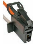
#5331PT (#5331C) Alternator Harness 2-16 ga Leads Ford 1974-77