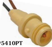
#5410PT (#5410C) Side Marker-License GM 12083460 1982-95 2-18 ga Leads Bulb 194