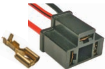
#5407PT (#5407C) Universal Sealed Beam 3 Prong Flasher 3-14 ga Leads Bulb 9003 & H4 #1579 Replacement Terminal Page 16