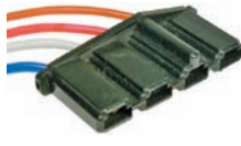
#5438PT (#5438C) Voltage Regulator Repair Harness 4-18 ga Leads GM 1961-73 Delco 7700 GM 88860584 PT2029