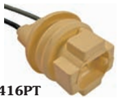
#5416PT (#5416C) Chrysler 1972-88 3513686, 4055028, 4400588 2-16 ga Leads Bulb 67, 158, 161, 168, 194, 194A