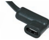
#5344PT (#5344C) Universal 1/4" Male Tab 1-12 ga Lead Bulb H1 & H3