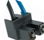
#5343PT (#5343C) Import Car 2-14 ga Leads Bulb H7