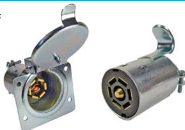
#0721PT (#0721P) Female Socket