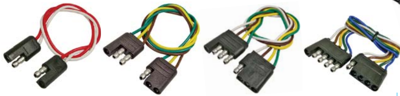
#1871 or #0710 #1872 or #0711 #1873 or #0712 #0718 Prewired Molded PVC Trailer Connectors - Male & Female Tin Plated Contacts 12" 16 Gauge Wire Loop - Polarized & Color Coded