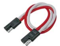
Molded 2-Way 12" 10 Ga Wire Lead