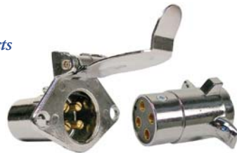
#1875 or #0724 Female Socket

Heavy Duty Die Cast Metal Connectors Polarized - Dust & Water Resistant 12-24 Volts 35 Amp