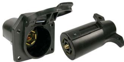
#0707PT (#0707P) Female Socket