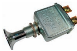
#5522PT (#5522C) On-Off Push-Pull SPST Heavy Duty Chrome Plated Metal Knob 2 Copper Terminals with 2 Brass Screws 1/2" Mount Hole 6-28 Volt 75 Amp