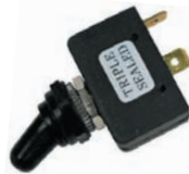
#5513PT (#5513C) On-Off Toggle w/Boot Nut 2 Position - 2 Terminal 3/4" Handle Length 2 1/4" Male Tabs Moisture Proof Metal Body - Dipped 12 Volt 20 Amp