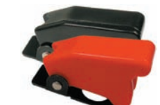
Toggle Safety Cover Spring Loaded Design Fits Most Bat Style Toggles #5568PT (#5568C) Red #5569PT (#5569C) Black