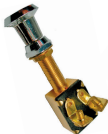
#5528PT (#5528C) Push-Pull Brass Switch On-Off SPST Chrome Plated Knob 2 Screw Terminals 3/8" Mount Hole 6 Volt 25 Amp 12 Volt 15 Amp