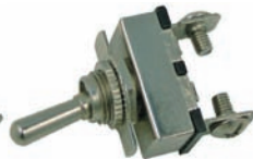
#5578PT (#5578C) Momentary On-Off Toggle SPST 5/8" Metal Bat Handle With Indicator Plate 1/2" Mount Hole 12 Volt 20 Amp