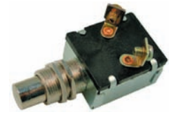
#5512PT (#5512C) Push Button Momentary On 5/8" Mount Hole 6 Volt 25 Amp 12 Volt 15 Amp