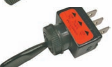
#5542PT (#5542C) On-Off-On SPDT