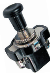
#5579PT (#5579C) Euro On-Off Push-Pull Short Style SPST Plastic Knob With 2 M3 Screws 5/16" Mount Hole 12 Volt 16 Amp