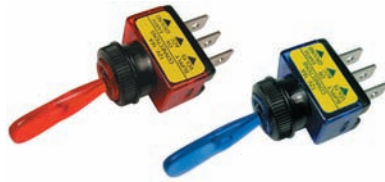
#5536PT (#5536C) - Red #5537PT (#5537C) - Blue #5538PT (#5538C) - Amber #5539PT (#5539C) - Green

On-Off Toggle SPST Illuminated Nylon Housing 1/4" Male Tabs 1" Handle Length 1/2" Mount Hole 12 Volt 16 Amp