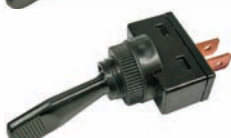
#5541PT (#5541C) Momentary On-Off SPST