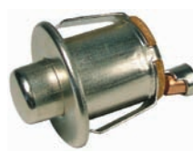
#5508PT (#5508C) Universal Starter Switch With Ground Receptacle Push Button Momentary On Snaps Into 15/16" Hole 6 Volt 15 Amp 12 Volt 10A / 24 Volt 6A