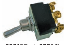
#5558PT (#5558C) Moment On-Off-Moment On DPDT Toggle 3/4" Handle Length 6 Screw Terminals 12 Volt 25 Amp 125 VAC 20 Amp