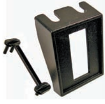
#5502PT (#5502C) Rocker Switch Panel 1/2" x 1-3/16" Rectangle Hole 1-3/8" x 1-5/8" Black Modular Style