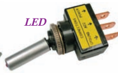
#5571PT (#5571C) On-Off Toggle SPST Red LED Lighted Tip Brushed Aluminum Handle 7/8" Handle Length 1/2" Mount Hole 12 Volt 15 Amp