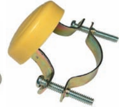
#5505PT (#5505C) Horn Button Large Ivory Button 2 #6 Screw Contacts 1-3/4" Diameter Bracket with Screws Fits Up To 1-1/2" Steering Column 12 Volt 5 Amp