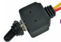
#5588PT (#5588C) On-Off Toggle SPST Waterproof Bat Handle With Boot 2 6" 16 Ga Wire Lead 1/2" Mount Hole 12 Volt 25 Amp