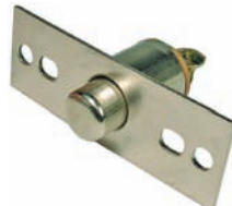
#5507PT (#5507C) Door Alarm Switch Doors - Hoods - Trunks On - Button Extended Dual Mounting Holes 12 Volt 10 Amp