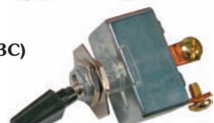
#5573PT (#5573C) On-Off SPST Black Handle