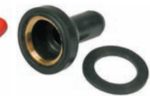
#5570PT (#5570C) Weather Resistant Boot With 1/2" Mounting Nut and Washer Fits 3/8" - 5/8" Length Toggle Switches

On-Off Toggle SPST Illuminated Nylon Housing 1/4" Male Tabs 1" Handle Length 1/2" Mount Hole 12 Volt 16 Amp