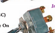
#5544PT (#5544C) Momentary On- Off-Momentary On SPDT