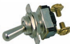
#5576PT (#5576C) On-Off Toggle SPST 1/2" Metal Bat Handle With Indicator Plate 1/2" Mount Hole 120 VAC 6 Amp 240 VAC 3 Amp