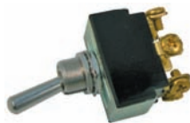
#5549PT (#5549C) On-Off-On Toggle DPDT 3/4" Handle Length 6 Screw Terminals 12 Volt 25 Amp 125 VAC 20 Amp