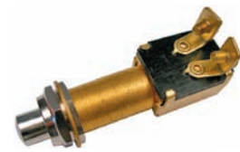
#5527PT (#5527C) Marine Push-Button Momentary On SPST Starter & Horn Switch Chrome Plated Brass 2 Screw Terminals 5/8" Mount Hole 6 Volt 25 Amp 12 Volt 15 Amp