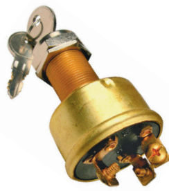
#5529PT (#5529C) Brass Heavy Duty Ignition Starter Switch Accessory-Start-Off 3 Position - 3 Screw Terminals 13/16" Mount Hole 6 Volt 25 Amp 12 Volt 15 Amp