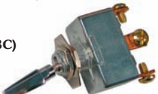
#5543PT (#5543C) On-Off-On SPDT

Heavy Duty Toggle Chrome Plated With Copper Screw Terminals Die Cast Housing With Indicator Plate 1/2" Mount Hole / 1" Handle Length 6-12 Volt 50 Amp