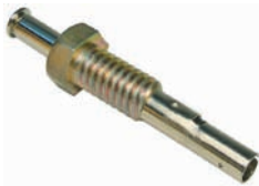
#5506PT (#5506C) Door Jamb Switch Self Grounding 3/8" Travel Length 2" Overall Length 12 Volt 1 Amp