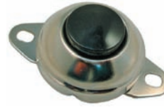
#5504PT (#5504C) Horn Button Flush Mount 12 Volt 5 Amp 2 #6 Screw Contacts Nickel Plated Housing Black Plastic Button