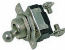
#5511PT (#5511C) On-Off Toggle SPST 1/4" Metal Ball Handle With Indicator Plate 1/2" Mount Hole 12 Volt 10 Amp 125 VAC 5 Amp