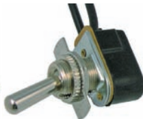
#5547PT (#5547C) On-Off Toggle SPST 3/4" Metal Bat Handle With Indicator Plate 2-16 ga Wire Leads 12 Volt 15 Amp 125 VAC 10 Amp