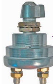
#5574PT (#5574C) Master Battery Disconnect 2 Stud Terminal 3/4" Mount Hole For Battery Circuit Only On - Off SPST 6-36 Volt 190 Amp DC Continual 1000 Amp DC Momentary