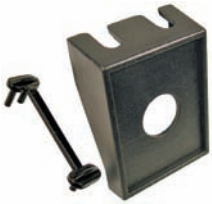
#5501PT (#5501C) Toggle Switch Panel 1/2" Hole Diameter 1-3/8" x 1-5/8" Black Modular Style