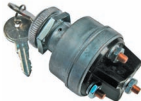
#5503PT (#5503C) Ignition Switch - 2 keys Accessory-Off-Ignition-Start 12 Volt 30 Amp 3/4" Mount Hole Plated Steel w/4 Terminal Studs