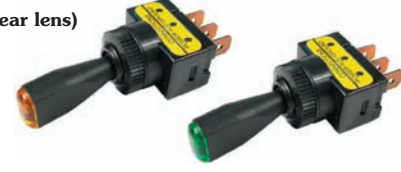
#5560PT (#5560C) - Red (clear lens) #5561PT (#5561C) - Blue #5562PT (#5562C) - Amber #5563PT (#5563C) - Green

Black Toggle Black Nylon Housing 1/4" Male Tabs / 1" Handle Length 1/2" Mount Hole 12 Volt 16 Amp