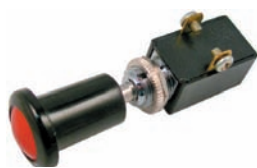
#5520PT (#5520C) On-Off Push-Pull SPST Pull For On Red Illuminated 2 Screw Terminals 1/2" Mount Hole 6 Volt 25 Amp 12 Volt 15 Amp Uses Bulb #282