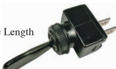
#5540PT (#5540C) On-Off SPST

Black Toggle Black Nylon Housing 1/4" Male Tabs / 1" Handle Length 1/2" Mount Hole 12 Volt 16 Amp