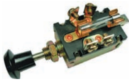
#5514PT (#5514C) Push-Pull Headlamp Switch with 15 Amp Fuse 3 Position Off-On-On Pull For On 5 Screw Terminals 3/8" Mount Hole 12 Volt 15 Amp