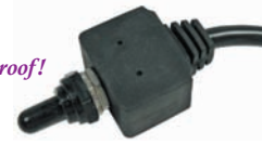
#5589PT (#5589C) Momentary On-Off- Momentary On Toggle SPDT - 3 Position Waterproof Bat Handle With Boot 3 6" 16Ga Jacketed Wire Leads 1/2" Mount Hole 12 Volt 25 Amp