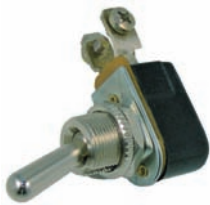
#5510PT (#5510C) On-Off Toggle SPST 3/4" Metal Bat Handle 1/2" Mount Hole 12 Volt 15 Amp 125 VAC 10 Amp

All Packaged One Per Pack - Consult Price Sheet For Bulk Packaging