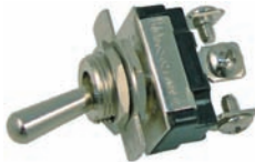
#5546PT (#5546C) On-Off-On Toggle SPDT 5/8" Metal Bat Handle With Indicator Plate 1/2" Mount Hole 12 Volt 10 Amp 3/4 HP 120-240 VAC