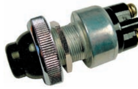
#5509PT (#5509C) Heavy Duty Push Button Momentary On Rubber Dust & Moisture Resistant Boot Nut 5/8" Mount Hole 12 Volt 60 Amp