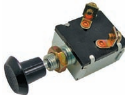
#5521PT (#5521C) On-Off Push-Pull SPST Pull For On 2 Screw Terminals 1/2" Mount Hole 6 Volt 25 Amp 12 Volt 15 Amp