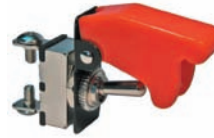
#5599PT (#5599C) Red Toggle Cover & On-Off Toggle (#5568 + #5577) 1/2" Mount Hole 12 Volt 20 Amp