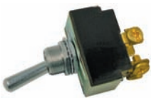
#5548PT (#5548C) On-Off Toggle DPST 3/4" Handle Length 4 Screw Terminals 12 Volt 25 Amp 125 VAC 20 Amp