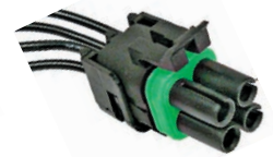
#5794PT (#5794C) Four Cavity Square Tower with Female Terminals