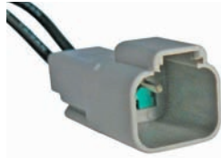
#6011PT (#6011C) 2-Way Female Housing With Male Contacts