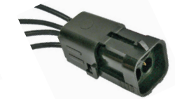
#5799PT (#5799C) Four Cavity Square Shroud with Male Terminals

All Items with QT, KT, GT or PT Suffix are Clam Shell Program Items.