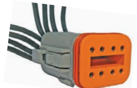
#6018PT (#6018C) 8-Way Male Plug Housing With Female Contacts