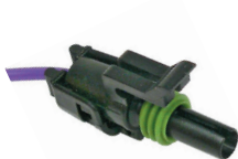
#5790PT (#5790C) Single Cavity Tower with Female Terminals

Like Cavity Tower and Shroud are Mating Connectors Assembled Connectors with 18 Gauge Crosslink SXL Wire Current Capacity 20 Amps Temperature Rating -40°F to 275°F (-40°C to 135°C)