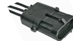
#5797PT (#5797C) Triple Cavity Shroud with Male Terminals