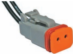
#6010PT (#6010C) 2-Way Male Plug Housing With Female Contacts