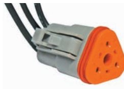
#6012PT (#6012C) 3-Way Male Plug Housing With Female Contacts