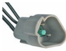
#6013PT (#6013C) 3-Way Female Housing With Male Contacts