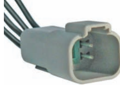
#6015PT (#6015C) 4-Way Female Housing With Male Contacts