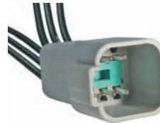
#6017PT (#6017C) 6-Way Female Housing With Male Contacts