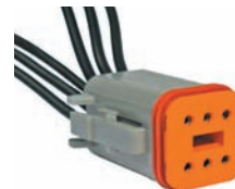
#6016PT (#6016C) 6-Way Male Plug Housing With Female Contacts