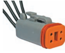
#6014PT (#6014C) 4-Way Male Plug Housing With Female Contacts