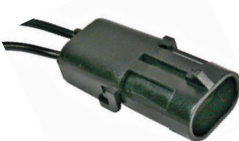
#5796PT (#5796C) Double Cavity Shroud with Male Terminals