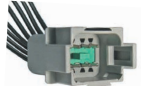
#6019PT (#6019C) 8-Way Female Housing With Male Contacts