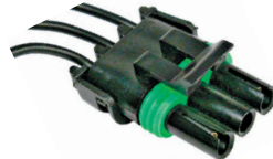
#5792PT (#5792C) Triple Cavity Tower with Female Terminals