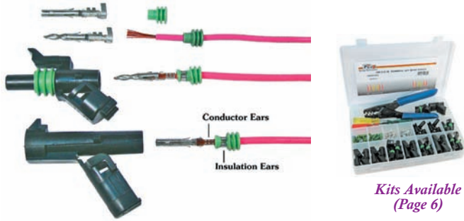
Kits Available (Page 6)

Easy to Repair Weatherpack Connections Slip Cable Seal Over Wire & Strip Wire Ends Insert Wire Until Insulation Butts Up To Conductor Ears Of Terminal Crimp Conductor Ears Slide Cable Seal To Middle Of Insulation Ears Crimp Insulation Ears Insert Crimped Terminal Into Housing Until It Clicks Into Place Snap Male & Female Housing Together