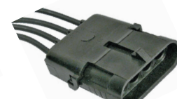
#5798PT (#5798C) Four Cavity Shroud with Male Terminals