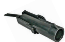
#5795PT (#5795C) Single Cavity Shroud with Male Terminals