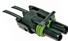
#5791PT (#5791C) Double Cavity Tower with Female Terminals